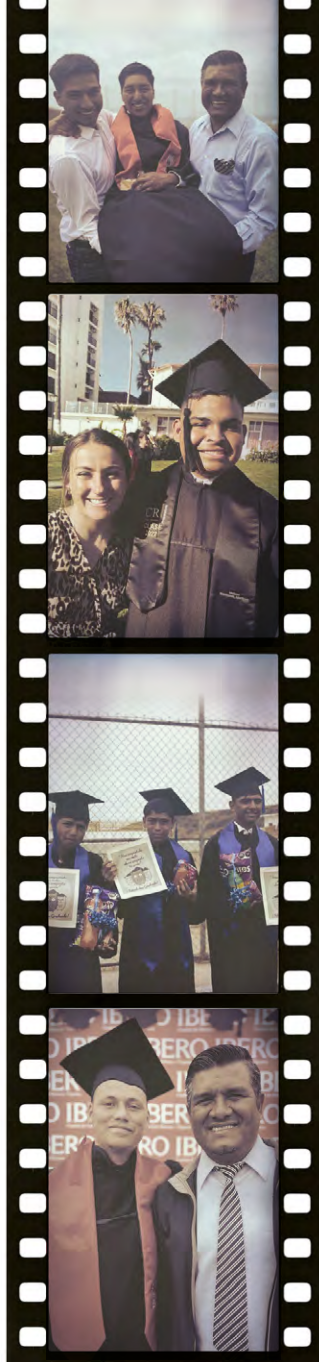
THE CLASS OF 2022