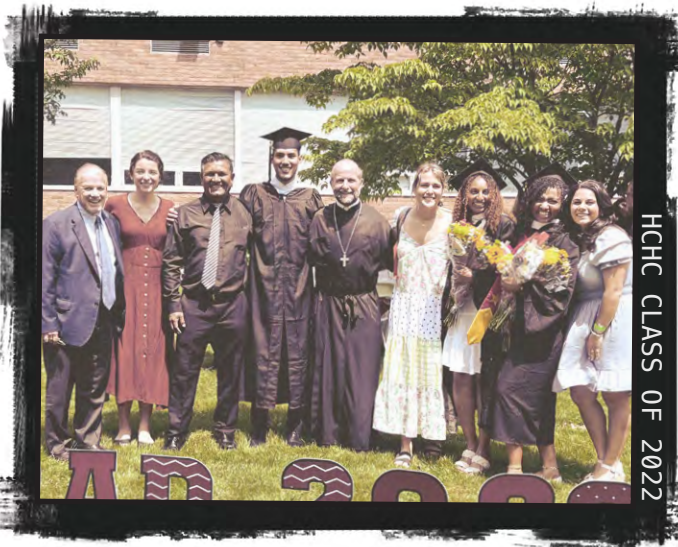
HCHC CLASS OF 2022

This year during our graduation celebration, I overheard many conversations among the boys looking forward to their own graduations. It brings me joy to hear these sentiments, especially from the younger boys who truly look to their older brothers as role models. There is a tangible, noticeable change in what they expect from themselves and what they feel is attainable. This IS the new normal.